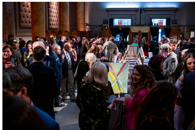
Image: Guests enjoying the art auction during cocktail hour at NYFA's 2023 Hall of Fame Benefit