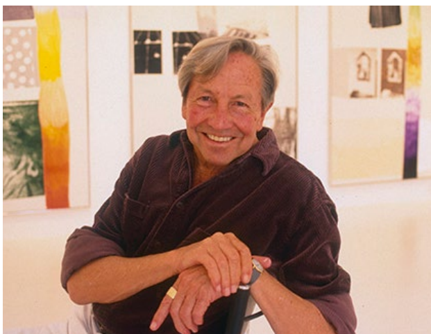
Robert Rauschenberg in front of his "Vydock" series photographed in Rauschenberg's Laika Lane studio, Captiva, FL, 1995.