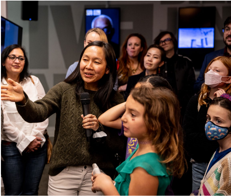
Image: "In/Between 2023: Lush Friction,"

During the past fiscal year, NYFA Learning has directly served 2,785 artists and cultural workers —through both in-person and online professional development programs and workshops. An additional 650+ were provided with access to workshop materials and 9,300+ subscribed to our newsletter. NYFA Learning’s core goals are to build and foster creative communities through education, offered locally, nationwide, and internationally. We offer tools and resources that artists and cultural workers can apply to their career and/or artistic practice.